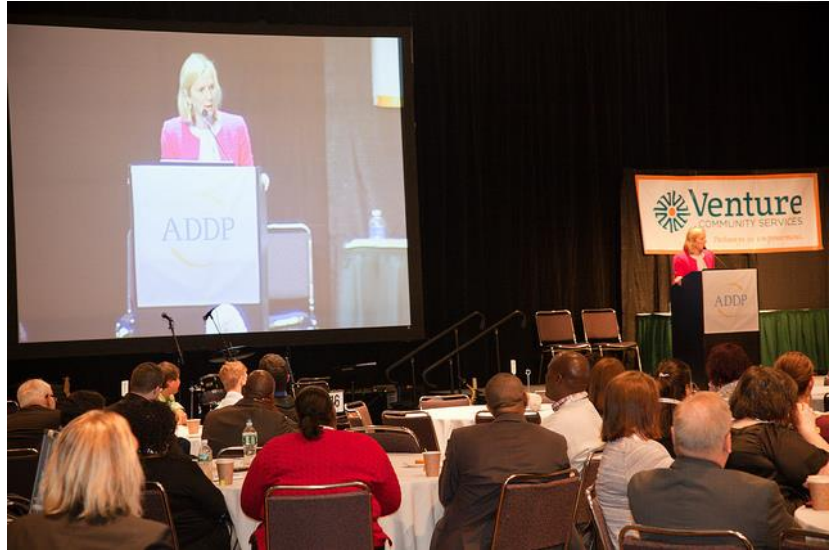
2016 ADDP Conference

Would you like to be recognized as the most prominent sponsor at the conference? Would you appreciate over 800+ attendees at the conference gazing at your company banner during the welcome session, keynote speech, luncheon, and award ceremony? If you answered yes, this sponsorship is for you! Help ADDP welcome former U.S. Secretary of Health and Human Services and Former Governor of Kansas, Kathleen Sebelius as our keynote speaker! This exclusive opportunity will be recognized in the following ways: