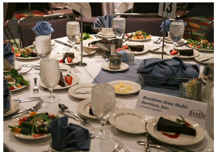
2016 ADDP Conference

*Sharing sponsorship will require splitting/sharing some benefits