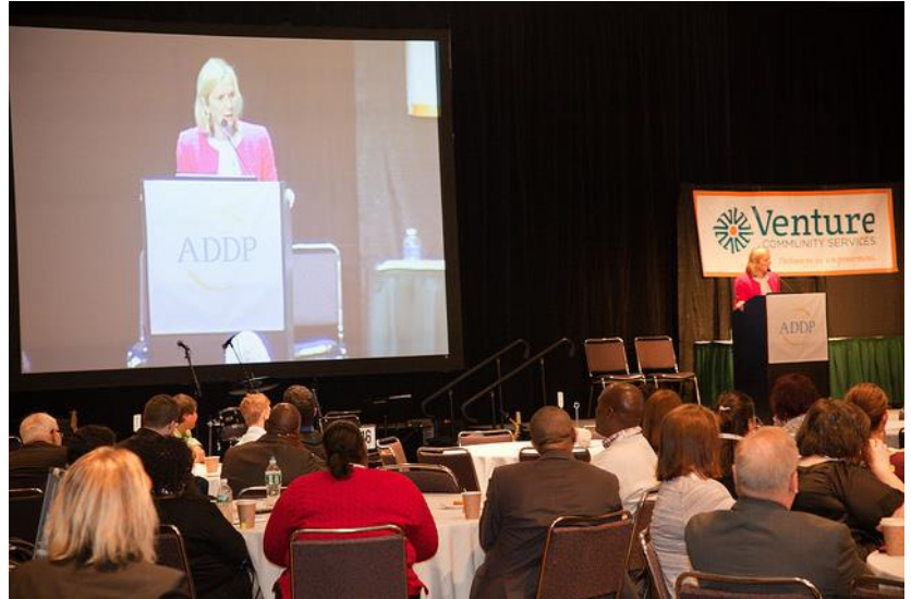
2016 ADDP Conference

Would you like to be recognized as the most prominent sponsor at the conference? Would you appreciate over 800+ attendees at the conference gazing at your company banner during the welcome session, keynote speech, luncheon, and award ceremony? If you answered yes, this sponsorship is for you! Help ADDP welcome former U.S. Secretary of Health and Human Services and Former Governor of Kansas, Kathleen Sebelius as our keynote speaker! This exclusive opportunity will be recognized in the following ways: